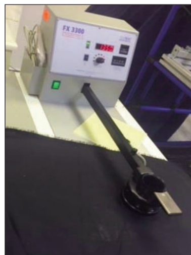
Fig. 2. Air permeability tester

Air permeability test results were evaluated statistically by ANOVA according the General Linear Model with SPSS 15.0 software package. In order to analyse the effect of weave and weft yarn density, multivariate analysis was made for the two groups of fabrics: one including fabrics which were not applied any finishing process, the other including fabrics applied finishing process. Significance degrees ( p ), which were obtained from ANOVA, were compared with